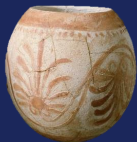
Phoenician Ostrich egg, painted 5th/4th century BC Ibiza, Museum of Puig des Molins (Balearic Islands, Spain)