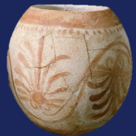
Phoenician Ostrich egg, painted 5th/4th century BC Ibiza, Museum of Puig des Molins (Balearic Islands, Spain)