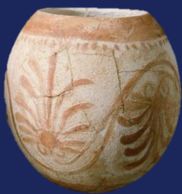
Phoenician Ostrich egg, painted 5th/4th century BC Ibiza, Museum of Puig des Molins (Balears Islands, Spain)

On February 19th – 21st the Municipality of Galera, in collaboration with the Provincial Council of Granada and the Andalusian Government, hosted the IV Annual Meeting of the Spanish Network of the Phoenicians' Route, attended by 31 members: mayors, councillors and institutional delegates. Among other events, it is worth mentioning the conference “The Cultural Routes of the Council of Europe, Declaration of Sibiu” by Pilar Barraca de Ramos, Technical Advisor, Ministry of Culture - Government of Spain.