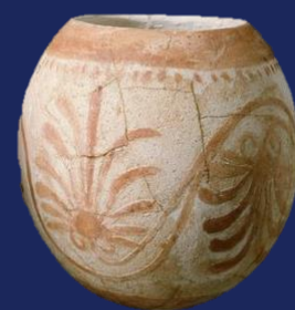
Phoenician Ostrich egg, painted 5th/4th century BC Ibiza, Museum of Puig des Molins (Balearic Islands, Spain)