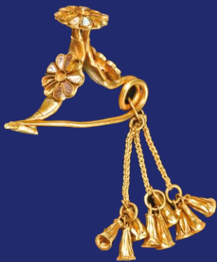
Kition's inverted bow-shaped gold fibula (Cyprus)