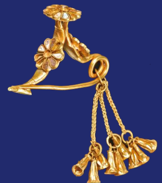
Kition's inverted bow-shaped gold fibula (Cyprus)