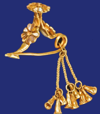
Kition’s inverted bow-shaped gold fibula (Cyprus)