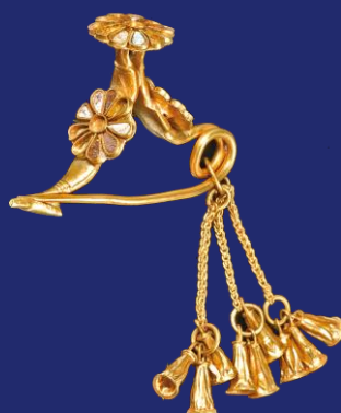
Kition's inverted bow-shaped gold fibula (Cyprus)