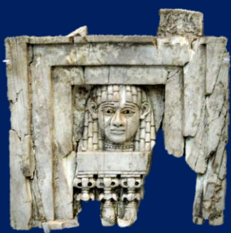
Ivory plaque with a woman at the window, from Nimrud (Iraq), IX-VIII century BC ca. The British Museum, London