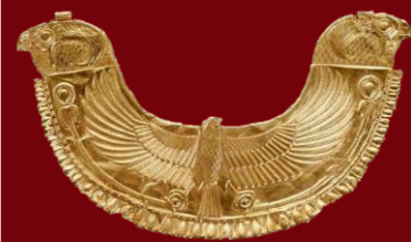
Phoenician gold broad collar, dated to c. 1750 BCE. Found in Byblos, Lebanon, the pectoral shows clear Egyptian influence Louvre Museum (France)