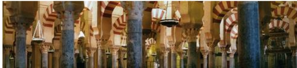
The Routes of El legado Andalusi