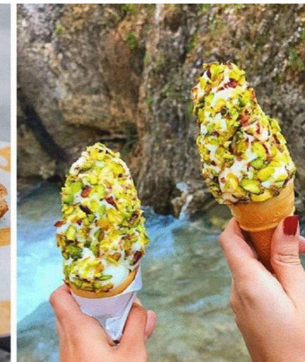
Lebanese oriental ice cream with Ashta and Postachop