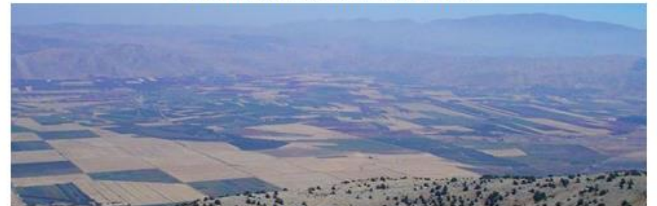
Iter Vitis the Wine Route