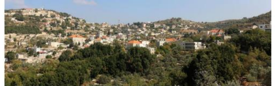
The Routes of the Olive Tree