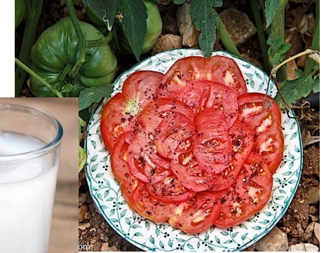
Mountains tomatoes with olive oil and Sumak