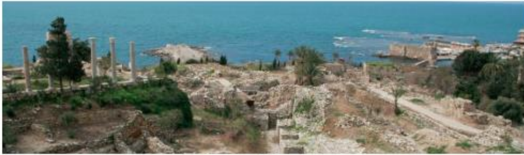
The Phoenicians' Route