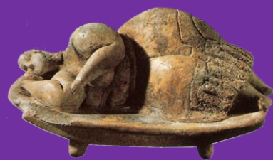
Mother Earth - Malta