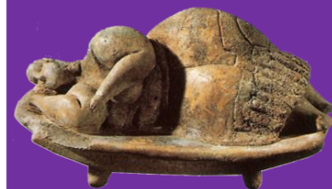
Mother Earth - Malta